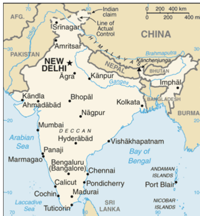
Map 1: Chennai, India