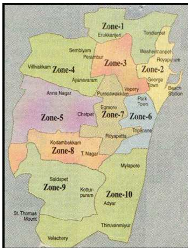
Map 3:Zones in the Chennai city

Generally speaking, objectionable slums are allowed to be evicted or relocated to alternative sites. Unobjectionable slums on public land are tolerated, better officially recognized. Their Zonal offices have permission to enable their residents to the Corporation services and TNSCB runs a range of activities based on the upgrading and development programmes or projects in these settlements, moreover provides their residents property documents in some cases.