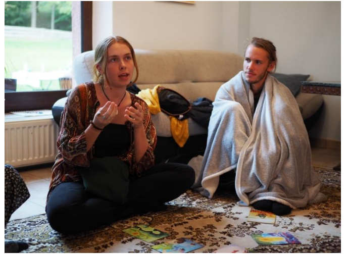
Using expressive therapies (movement, art, music, theatre...)