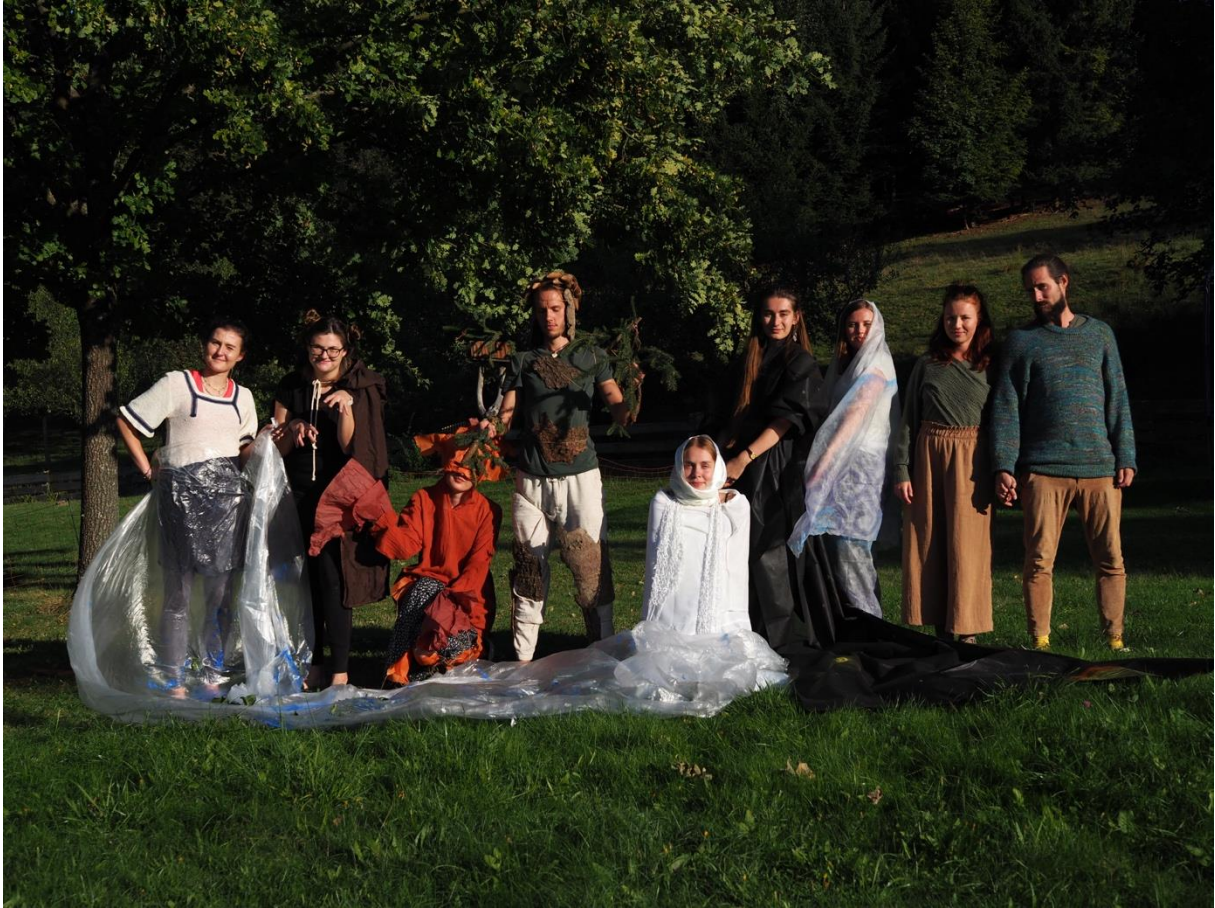
The photo from the gathering of all beings at the council for searching solutions to the common world.